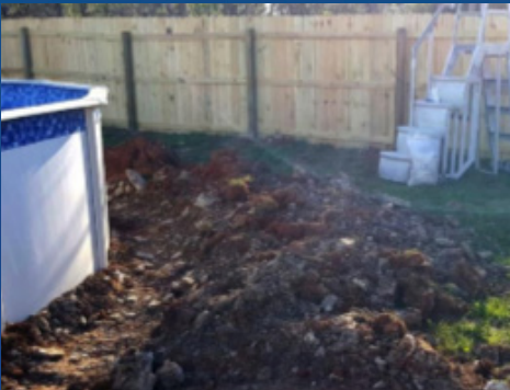
This pool had very little slope, but you can see how much dirt is left behind. It could look like this all the way around your pool.