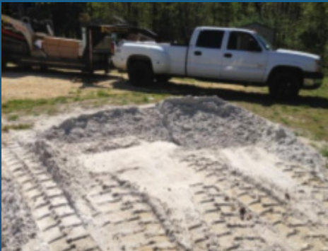
This is extra sand on the job site. It is more cost effective to order more sand and have some left over than to pay another delivery charge if you don't have enough. It will leave an ugly spot in your yard.

Below are some photos of installation and what to expect after the project is completed.