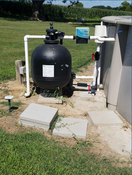
This shows what your pump and filter might look like. Notice that there is some dirt on the ground where there used to be grass. This is common, and most homeowners plant grass seed after construction.

If you have an existing deck around your pool, we can still install a new pool. The illustrations below show what your new pool may look like following installation. There will be gaps when replacing a pool of a different size. Even when replacing an identical size pool, pool models from different manufacturers often vary slightly in dimensions or number of uprights. This can result in the need for a carpenter to modify your deck before or after the installation.