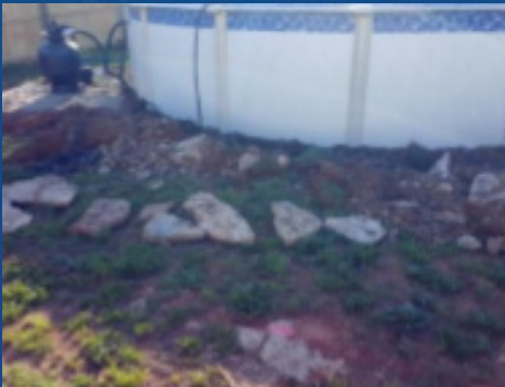
Some jobs have rock in the ground when we dig, so be aware that your yard could be the same.