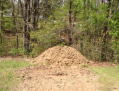
This picture shows where a homeowner asked us to move the dirt to the end of his property. This can be done by paying the excavator directly after the pool is installed. A local bobcat operator can be found to move dirt and grade your yard after the build for an affordable rate.